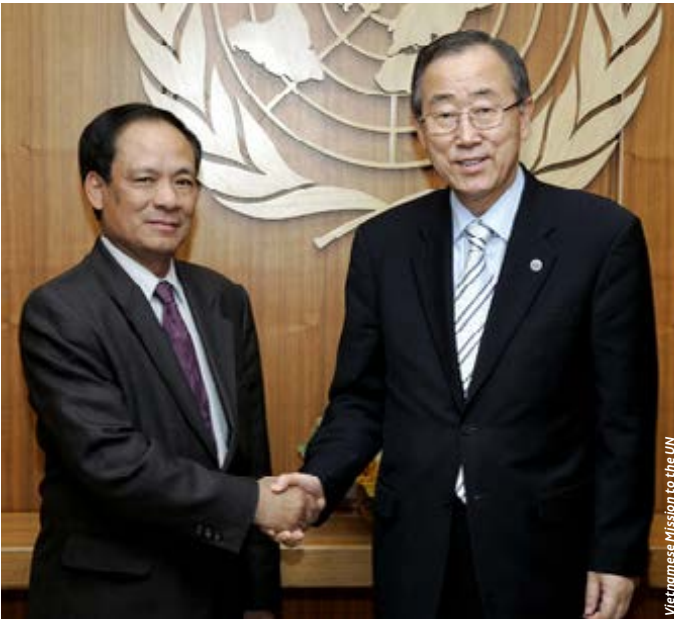
Vietnamese Mission to the UN

The year 2015 has been an historic one for ASEAN and the United Nations. ASEAN formally established the ASEAN Community and the world adopted the 2030 Agenda for Sustainable Development and the Paris Agreement on Climate Change. After witnessing the signing of the ASEAN Community Vision 2025, the Secretary-General of the United Nations, H.E. Mr. Ban Ki-Moon, congratulated the Leaders of ASEAN on becoming one community. He called for Vision 2025 and the Sustainable Development Goals to be complementary in order “to transform the lives of millions of people living in poverty”.